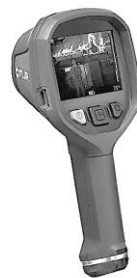
FD Thermal Imaging Camera

These high-tech devices will assist the firefighters during both active fires and search & rescue efforts.