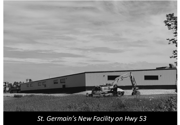
St. Germain's New Facility on Hwy 53

The business does over $10,000,000 in annual sales and has 54 local employees.